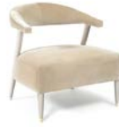
FEMINA W: 70 cm | 27,6" D: 70 cm | 27,6" H: 73 cm | 28,7"