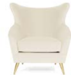
SOPHIA W: 85 cm | 33,5" D: 88 cm | 34,6" H: 94 cm | 37"