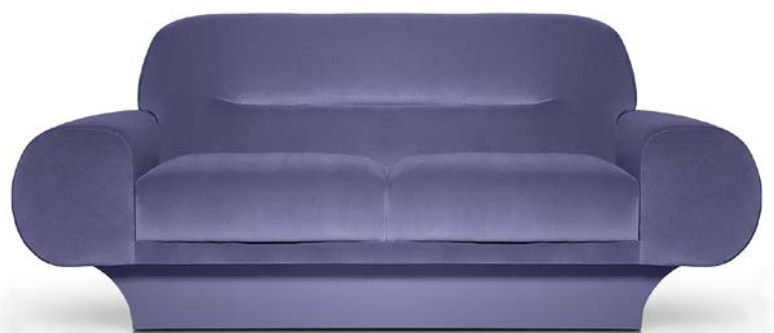
Roy 220 Sofa