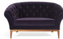
BE MINE W: 145 cm | 57,1" D: 93 cm | 36,6" H: 80 cm | 31,5"