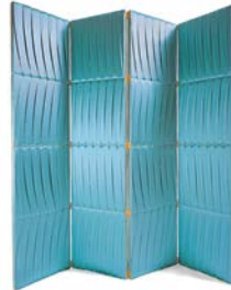
HIDE & SEEK W: 199 cm | 78,3" D: 4 cm | 1,6" H: 200 cm | 78,7"