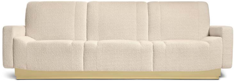
Gran Torino 280