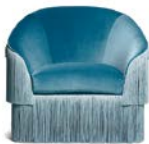
FRINGES W: 94 cm | 37" D: 85 cm | 33,5" H: 90 cm | 35,4"