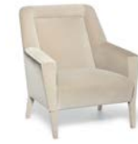
BLONDIE W: 87 cm | 34,3" D: 90 cm | 35,4" H: 97 cm | 38,1"