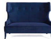
SOFT & CREAMY 2 SEAT W: 150 cm | 59,1" D: 92 cm | 36,2" H: 113 cm | 44,5"