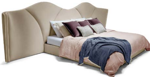
JOSEPHINE L DIMENSIONS W: 450 cm | 177,2" D: 223 cm | 87,8" H: 140 cm | 55,1" FITS MATTRESS W: 200 cm | 78,7" D: 200 cm | 78,7" H: Variable Available in more sizes