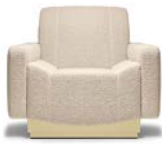
GRAN TORINO W: 102 cm | 40,2" D: 90 cm | 35,4" H: 78 cm | 30,7"