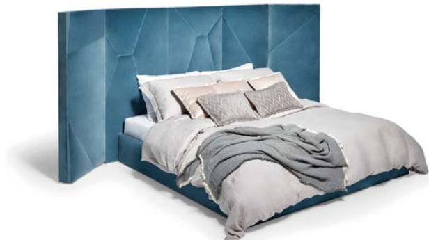
LET'S PLAY M DIMENSIONS W: 340 cm | 134" D: 220 cm | 86,7" H: 160 cm | 63" FITS MATTRESS W: 180 cm | 70,9" D: 200 cm | 78,7" H: Variable Available in more sizes