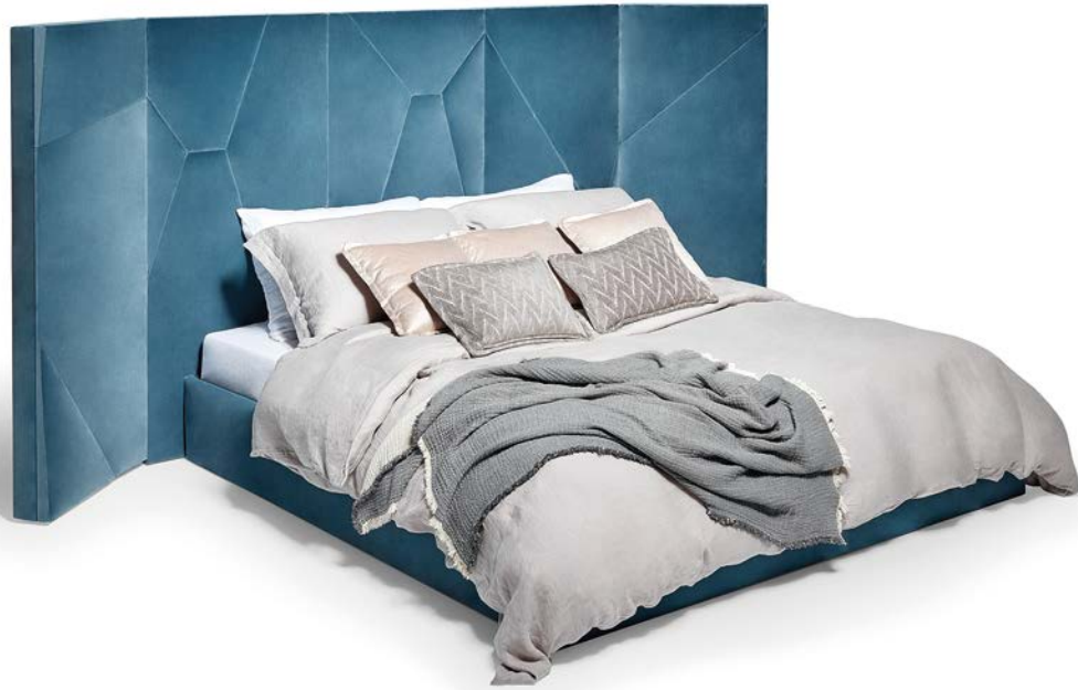
Let's Play M

LET'S PLAY M - W: 340 cm | 134" D: 220 cm | 86,7" H: 160 cm | 63" JOSEPHINE L - W: 450 cm | 177,2" D: 223 cm | 87,8" H: 140 cm | 55,1"