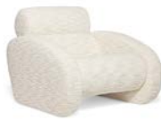
FRANK W: 88 cm | 34,6" D: 105 cm | 41,3" H: 79 cm | 31,1"