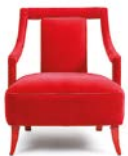
CORSET W: 80 cm | 31,5" D: 78 cm | 30,7" H: 85 cm | 33,5"