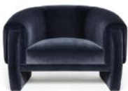
LUKE W: 120 cm | 47,2" D: 110 cm | 43,3" H: 82 cm | 32,3"