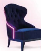
CANDY Limited edition W: 73 cm | 28,7" D: 83 cm | 32,7" H: 99 cm | 39"