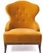
CANDY W: 73 cm | 28,7" D: 83 cm | 32,7" H: 99 cm | 39"