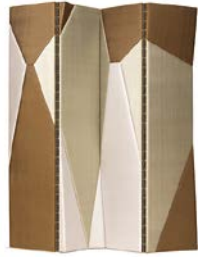
LET'S PLAY W: 195 cm | 76,8" D: 8 cm | 3,1" H: 200 cm | 78,7"