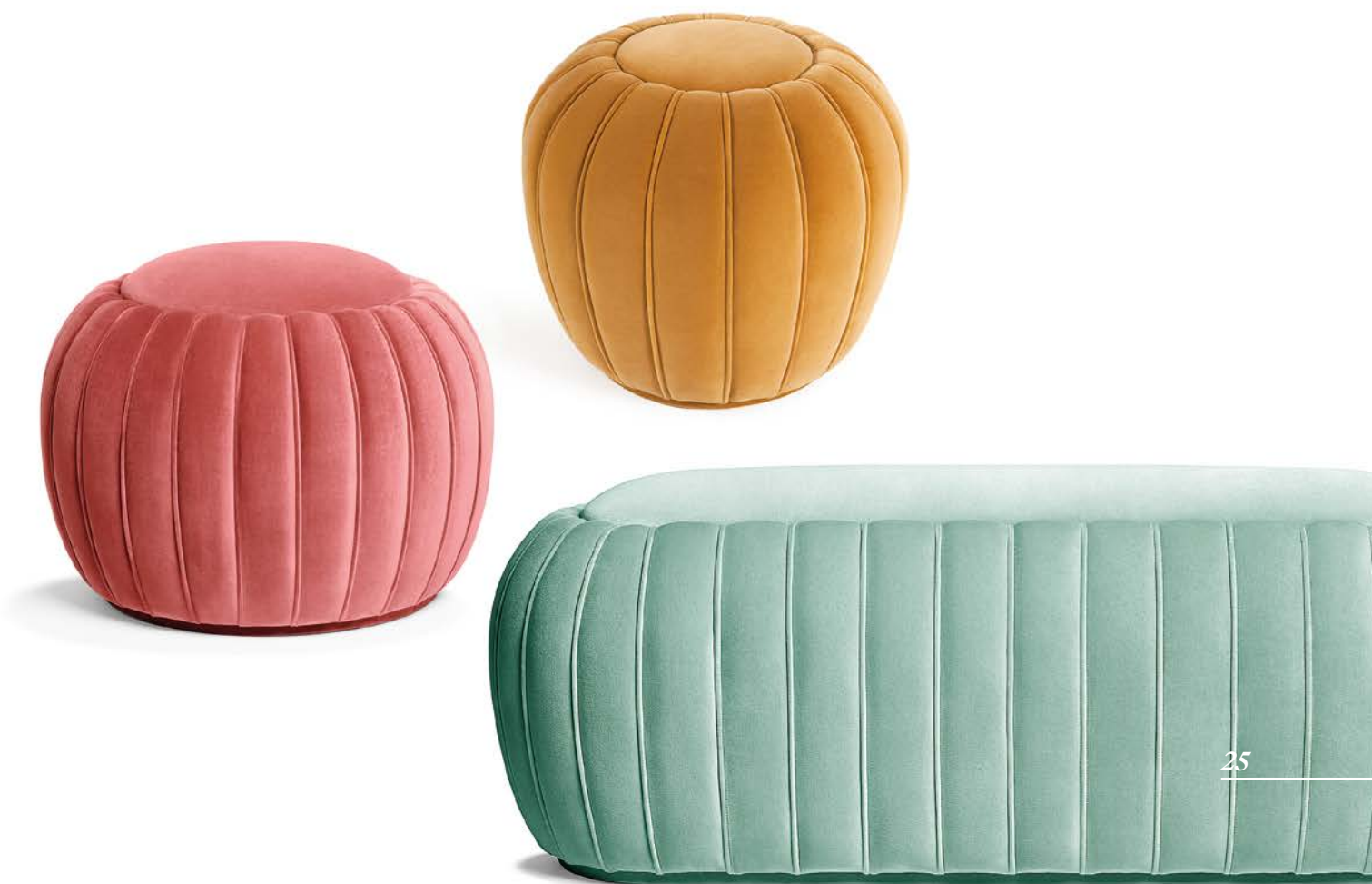
Mellow 70 / 50 / 140