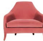
MARGARET W: 101 cm | 39,8" D: 87 cm | 34,3" H: 94 cm | 37"