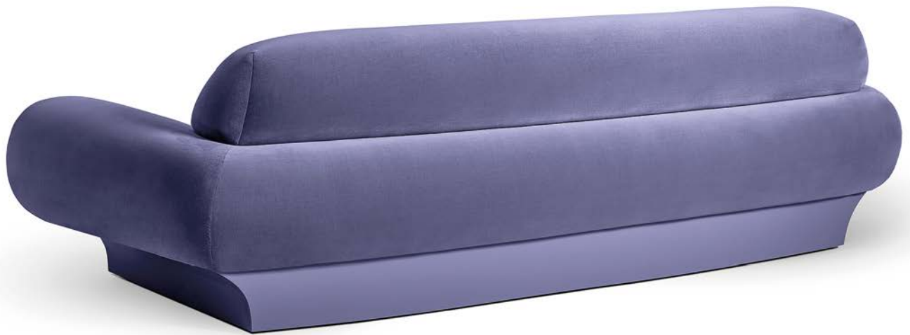
Roy 290 Sofa