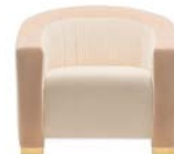
LOUISE W: 87 cm | 34,3" D: 80 cm | 31,5" H: 80 cm | 31,5"