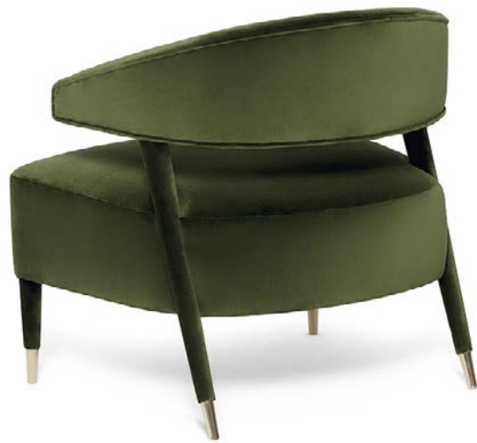
Femina - redesigned in 2020