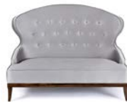
CANDY 2 SEAT W: 135 cm | 53,1" D: 85 cm | 33,5" H: 95 cm | 37,4"