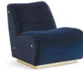
NEWMAN W: 78 cm | 30,7" D: 93 cm | 36,6" H: 75 cm | 29,5"