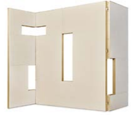
GOLDEN EYE W: 236 cm | 92,9" D: 5 cm | 2" H: 147 cm | 57,9"