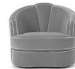
JOSEPHINE W: 93 cm | 36,6" D: 92 cm | 36,2" H: 82 cm | 32,3"