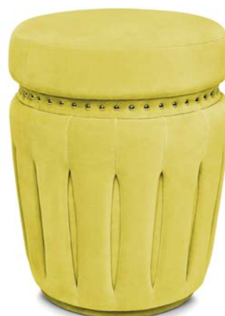
Belle de Jour