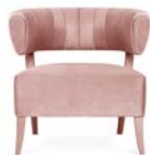
AILEEN W: 82 cm | 32,3" D: 78 cm | 30,7" H: 79 cm | 31,1"