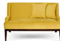
PRIVATE 2 SEAT W: 130 cm | 51,2" D: 90 cm | 35,4" H: 77 cm | 30,3"