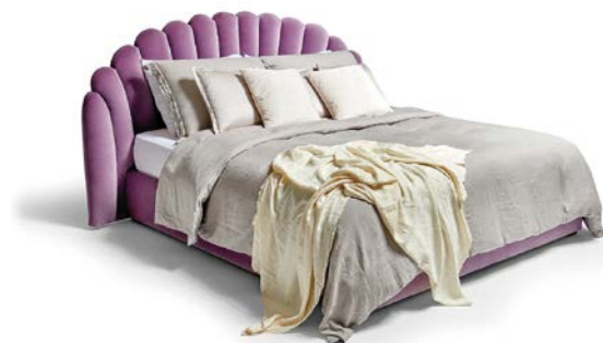
DAISY M DIMENSIONS W: 240 cm | 94,5" D: 228 cm | 89,8" H: 130 cm | 51,2" FITS MATTRESS W: 180 cm | 70,9" D: 200 cm | 78,7" H: Variable Available in more sizes