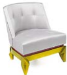
CAPRICE Limited edition W: 70 cm | 27,6" D: 72 cm | 28,3" H: 77 cm | 30,3"