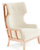
SOFT & CREAMY Limited edition W: 82 cm | 32,3" D: 88 cm | 34,6" H: 113 cm | 44,5"