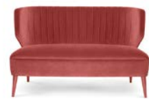
LIPSTICK 2 SEAT W: 130 cm | 51,2" D: 76 cm | 29,9" H: 79 cm | 31,1"