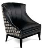
HERITAGE Limited edition W: 83 cm | 32,7" D: 85 cm | 33,5" H: 98 cm | 38,6"