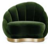
OLYMPIA W: 110 cm | 43,3" D: 100 cm | 39,4" H: 91 cm | 35,8" Right Version