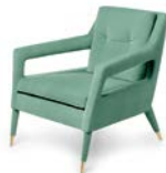
CHANTAL W: 78 cm | 30,7" D: 88 cm | 34,6" H: 85 cm | 33,5"