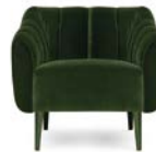
HOUSTON W: 84 cm | 33,1" D: 75 cm | 29,5" H: 73 cm | 28,7"