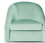
QUEEN B SWIVEL W: 100 cm | 39,4" D: 100 cm | 39,4" H: 93 cm | 36,6"