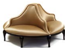
MADELEINE W: 180 cm | 70,9" D: 180 cm | 70,9" H: 97 cm | 38,2"