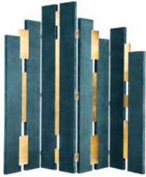
EMPIRE W: 212 cm | 83,5" D: 5 cm | 2" H: 201 cm | 79,1"