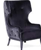
SOFT & CREAMY W: 82 cm | 32,3" D: 88 cm | 34,6" H: 113 cm | 44,5"