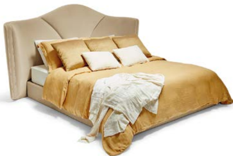
JOSEPHINE M DIMENSIONS W: 260 cm | 102,4" D: 223 cm | 87,8" H: 140 cm | 55,1" FITS MATTRESS W: 180 cm | 70,9" D: 200 cm | 78,7" H: Variable Available in more sizes