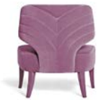
MELODY W: 76 cm | 30" D: 75 cm | 29,5" H: 80 cm | 31,5"