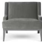
PRIVATE W: 87 cm | 34,3" D: 90 cm | 35,4" H: 77 cm | 30,3"