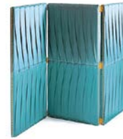
HIDE & SEEK W: 156 cm | 61,4" D: 4 cm | 1,6" H: 101 cm | 39,8"